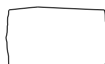
2cm & 3cm Slabs Filled/Honed