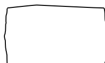
2cm & 3cm Slabs Honed